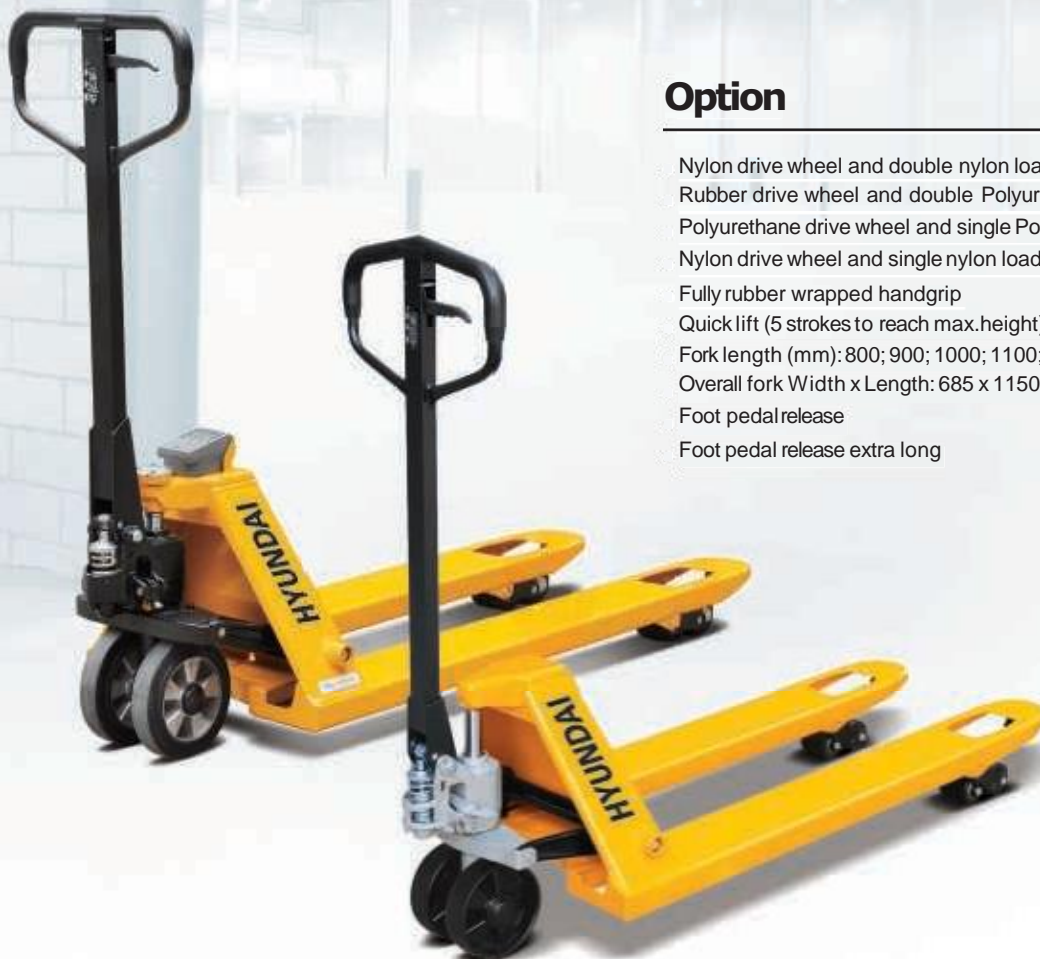
Photo may include optional equipment.